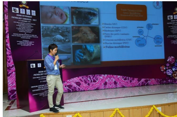
Fig.11 ASVP Technical Session in progress-Chair Persons viewing presentation Fig.12 A young international delegate presenting paper in ASVP Technical Session