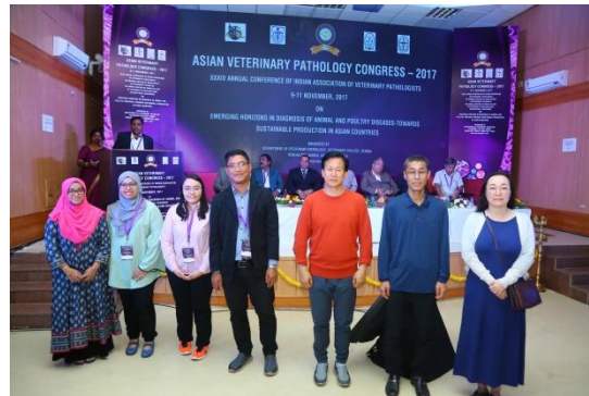
Fig.3 Delegates, guests and audience present in KVC Auditorium