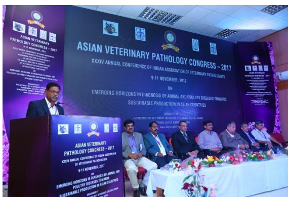
Fig. 4 International delegates from South-East Asian countries